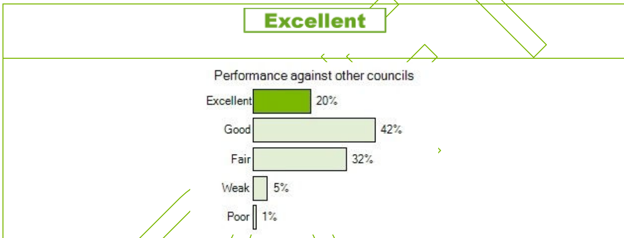
Figure 1 Overall performance of district councils in CPA

7 Chorley Borough Council was assessed as 'Excellent' in the Comprehensive Performance Assessment carried out in 2008. These assessments have been completed in all district councils and we are now updating these assessments, through an updated corporate assessment, in councils where there is evidence of change. The following chart is the latest position across all district councils.